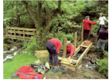
National Park maintenance team replacing footbridge at Highlow