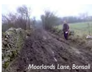
LAF vehicle sub-group site visits