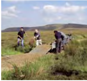
Volunteers helping to maintain the Pennine Way