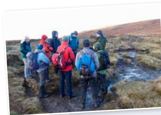
LAF members being updated on proposed repairs at Cutthroat Bridge, Ladybower