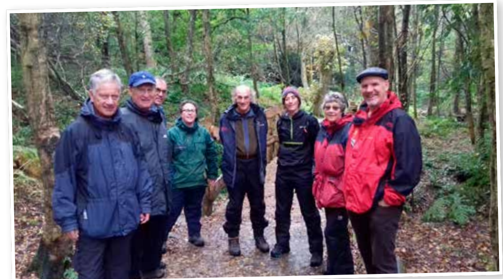
LAF visit to a proposed Miles without Stiles route at Longshaw