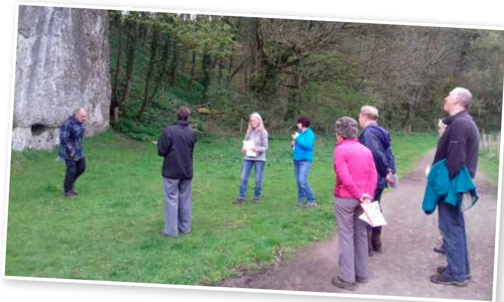
LAF Access Sub-group visit to Alport

The Forum was updated on the making of two traffic regulation orders and consulted on a proposal for another. The Authority reported on actions for the year ahead and progress on voluntary restraint, with legal status and repair updates being provided by Derbyshire County Council. The Green Lanes sub-group met in February and July.