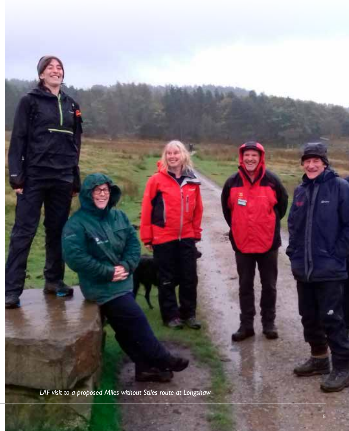
LAF visit to a proposed Miles without Stiles route at Longshaw

The Forum also undertook site visits to look at the management of farming, conservation and access, a proposed Miles without Stiles route, and to the route at Wetton.