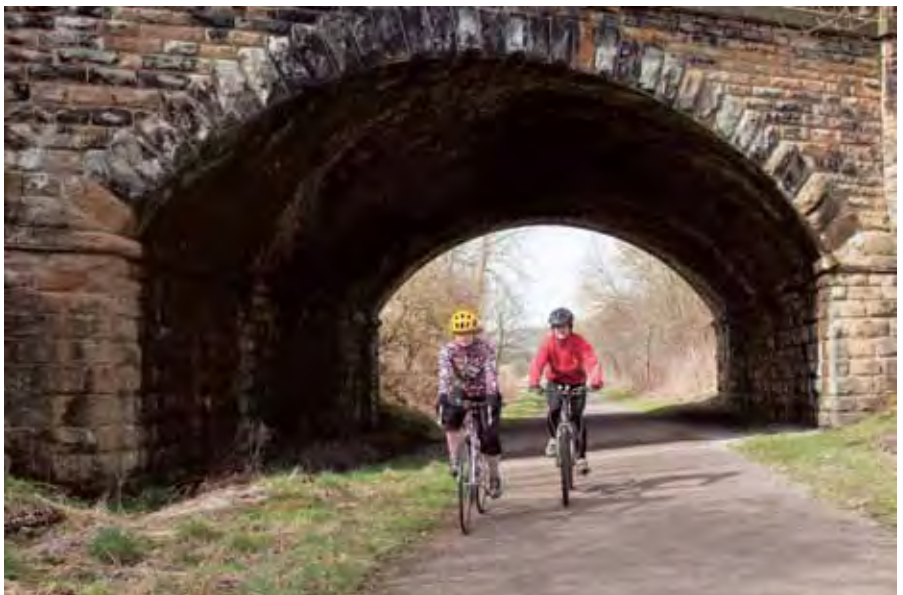
Cyclists on the Monsal Trail