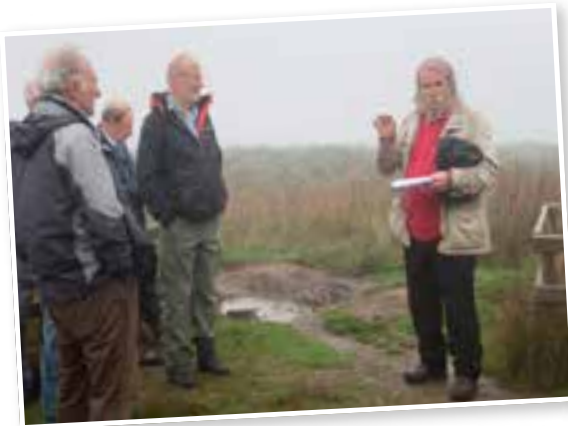
Open access anniversary celebrations

The LAF received updates from the Access Sub group which met in March, April, July and October to consider statutory reviews on directions restricting access, the access wish list, the dedication of National Nature Reserves and the celebration of the 10th anniversary of open access. The Forum welcomed the setting up of the Access Fund by the Authority.