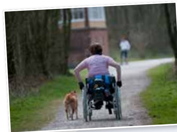
Access for all on the Tissington Trail