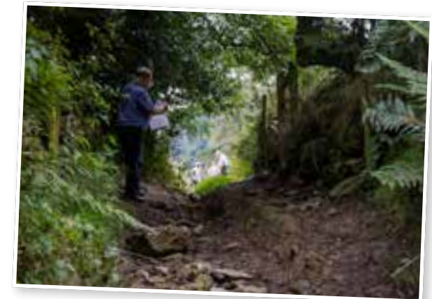
Green lane sub-group site visit to Hollinsclough

The Forum was updated on the action plans for managing motor vehicles on green lanes and off-road and the implementation of 4 traffic regulation orders during 2014 on which they had been formally consulted. The LAF also carried out site inspections on 4 priority routes in the Staffordshire part of the National Park. The Green Lanes sub-group met in February, September and November. A presentation was also given by Land Access and Recreation Association on their byway code and other issues related to recreational motor vehicle use.