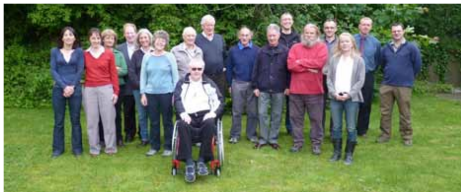
Local Access Forum members

Expenditure incurred is met by the National Park Authority's access budget with a contribution of £1,995.45 from Derbyshire County Council towards administration costs.