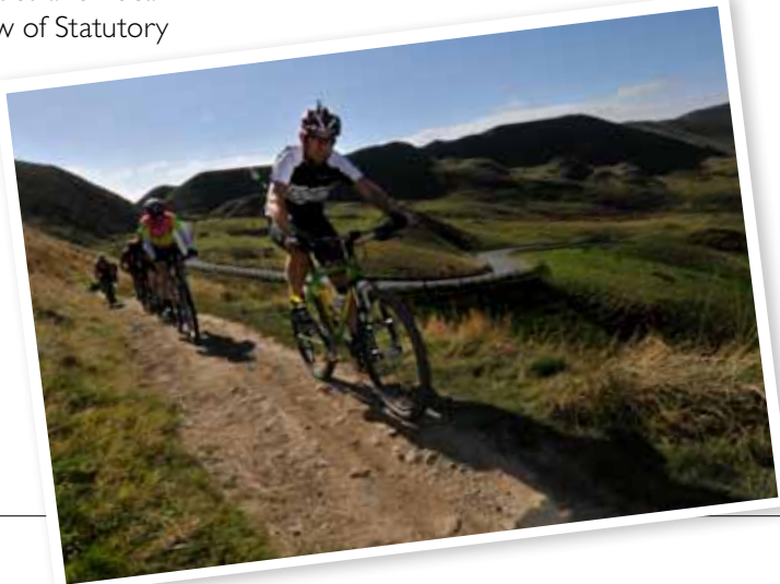
Mountain biking at Mam Tor