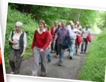
Black Harry Trails launch