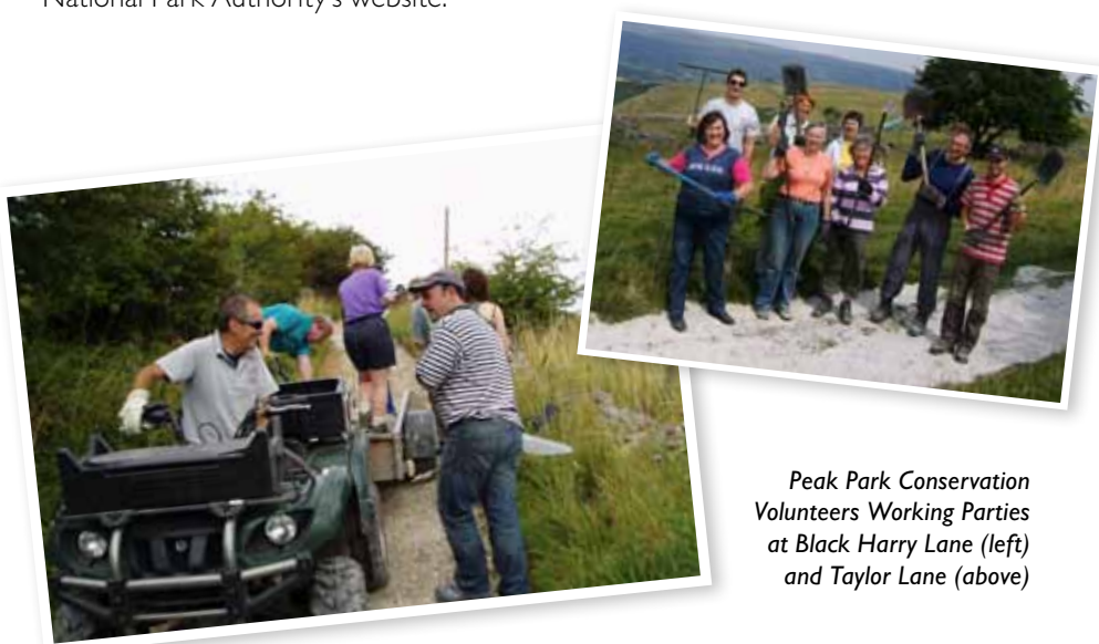
Peak Park Conservation Volunteers Working Parties at Black Harry Lane (left) and Taylor Lane (above)

All Forum meetings are open to the public and by prior arrangement members of the public may ask to speak at the meetings. Meetings are advertised on the National Park Authority's website.