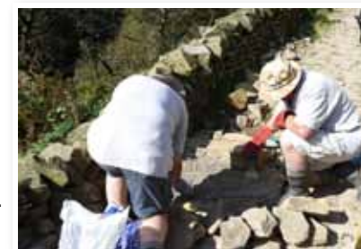
Peak Park Conservation Volunteers, Washgates

The Forum has been involved with commenting on the NPA's new Management Plan for the period 2012-16 and has been kept informed with progress. The plan will be formally launched in 2012.