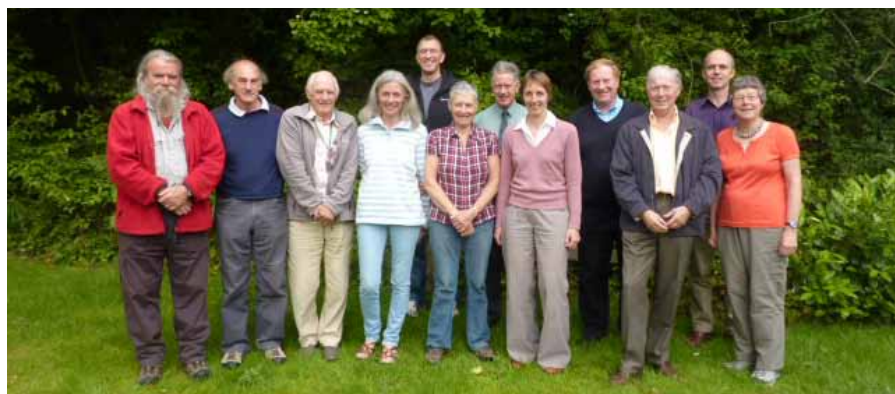
Local Access Forum Members

Expenditure incurred is met by the National Park Authority's access budget with a contribution of £1,934.46 from Derbyshire County Council towards administration costs.