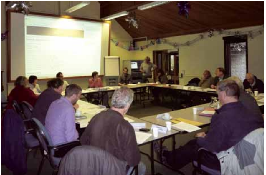
The Forum meets at Losehill Hall for the last time.