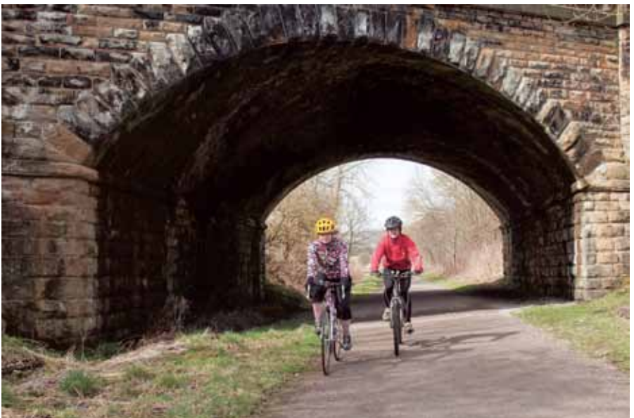
Cyclists on the Monsal Trail