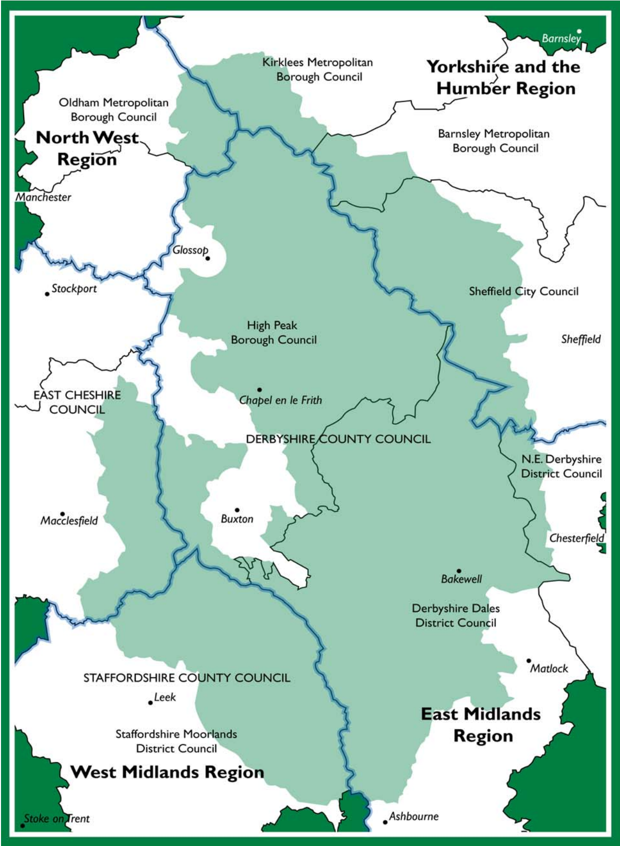
Figure 1.2: Peak District local authority and regional boundaries (Peak District National Park Management Plan 2006 – 2011)