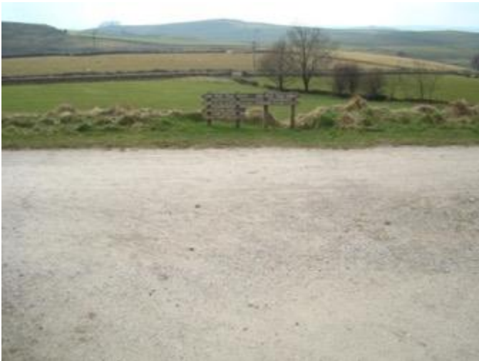
Tissington Trail entrance opposite Parsley Hay Cycle Hire Centre.

The trail can be accessed straight opposite the cycle hire entrance. The ground changes from concrete to compacted aggregate on the trail. It is all on the same level, with no steps. The team can advise which direction to go on the trail. There are directional signs on the route. You can also plan your route before you arrive at www.peakdistrict.gov.uk/visit/cycle