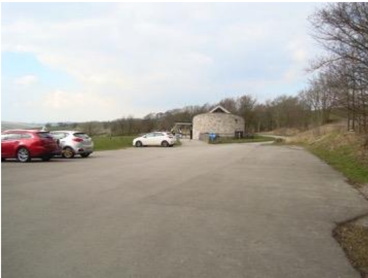
Parsley Hay Main Car Park is all level