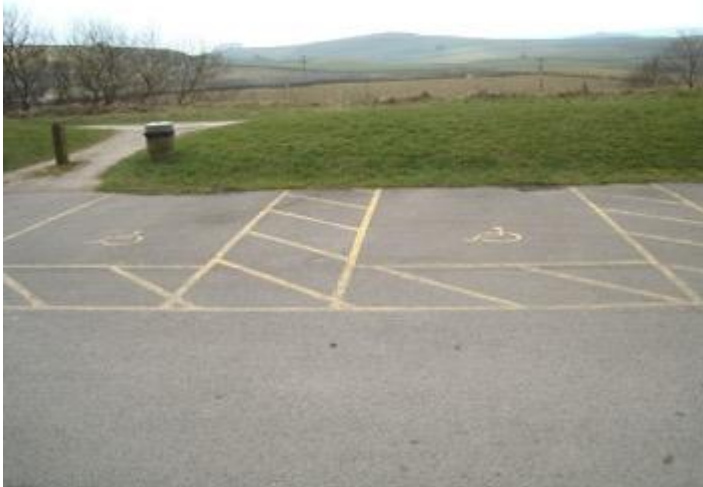
Accessible parking area 35m from the entrance.