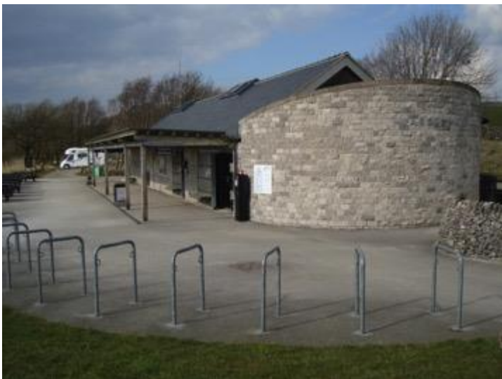
The approach to the centre.