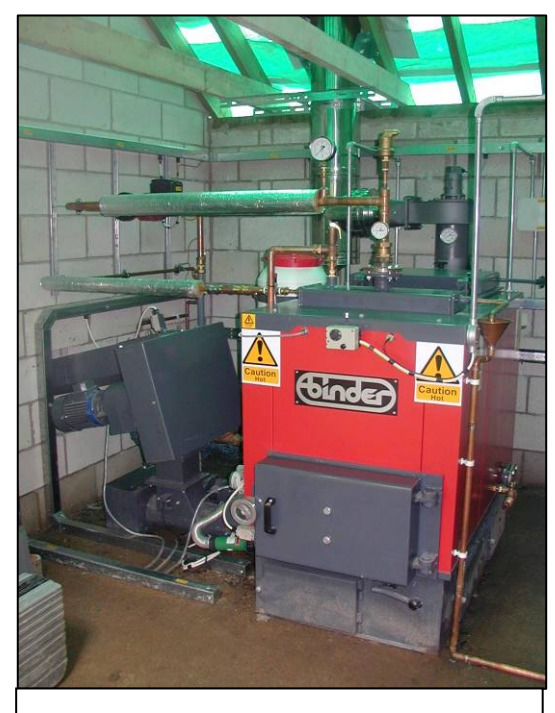
Losehill Hall's biomass boiler

Losehill Hall achieved eco-centre status in 2003, and as part of the on-going programme of work to improve its environmental footprint installed a new £50,000 Biomass heating system using renewable energy from locally sourced woodchips. This is hoped to provide up to half the Centres heating and hot water needs and cut its CO<sub>2</sub> emissions by up to 50 per cent.