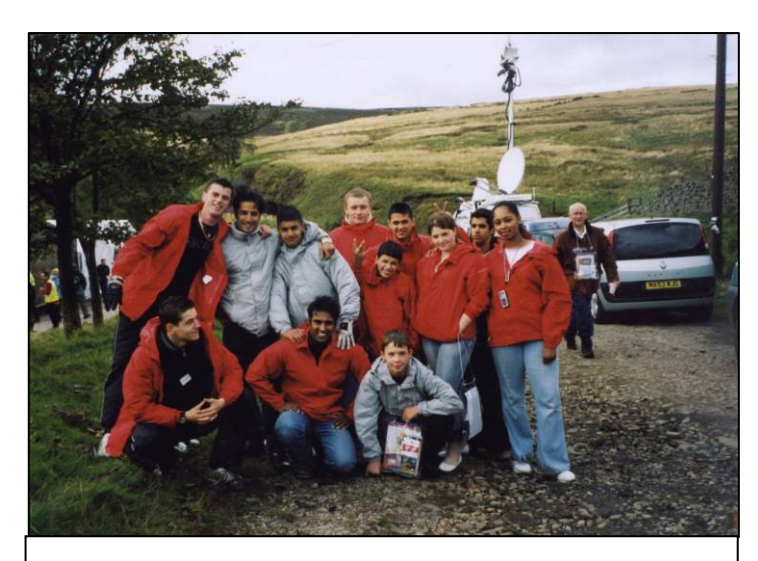
Young people from ARDIC Youth Group visiting the Peak District National Park

20 young people aged 15-16 qualified for the Peak District National Park Young Achievers Award, which they received at a ceremony on June 6, after learning countryside conservation. and first aid skills residential courses among the hills. For many, it was their first opportunity to get out into the countryside and learn about wildlife habitats.