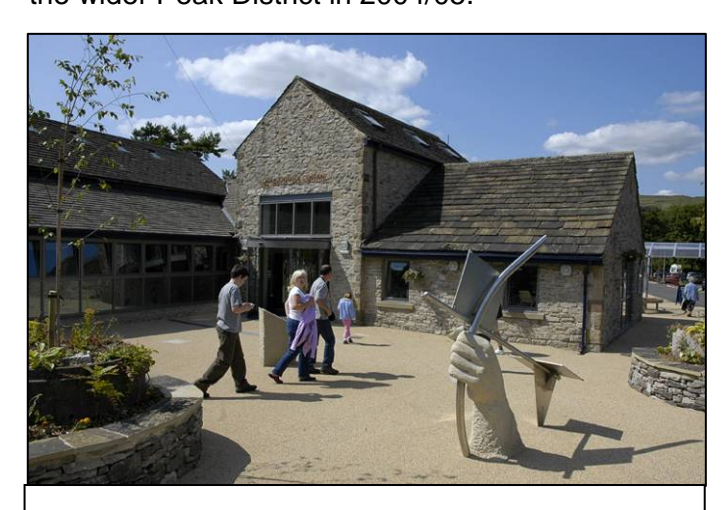
Castleton Visitor Centre

The website, <u>www.visitpeakdistrict.com</u>, attracted over 13 million hits during 2004 and the marketing campaigns generated additional visitor spending of £5.3 million in the wider Peak District in 2004/05.