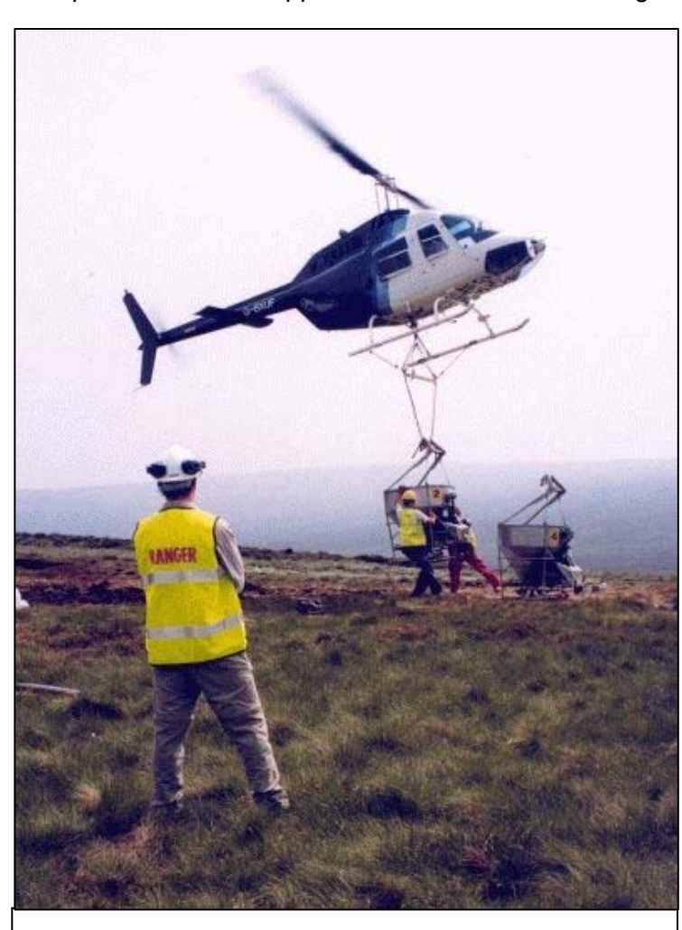
Using helicopters to restore damaged moorland

Moors for the Future – an 11 partner project - was launched in 2002 with £4.7m funding, mainly from the Heritage Lottery, to restore rare moorland and blanket bog that was severely eroded by fire, pollution and overgrazing, to carry out research and to improve recreation opportunities and understanding.