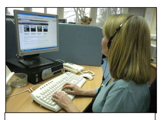
Improved Customer Service Team

A new Customer Service Team was established in April 2004 which, along with better IT systems, has the aim of providing quicker, more responsive, high-quality and effective customer services, whether in person, on the phone or electronically