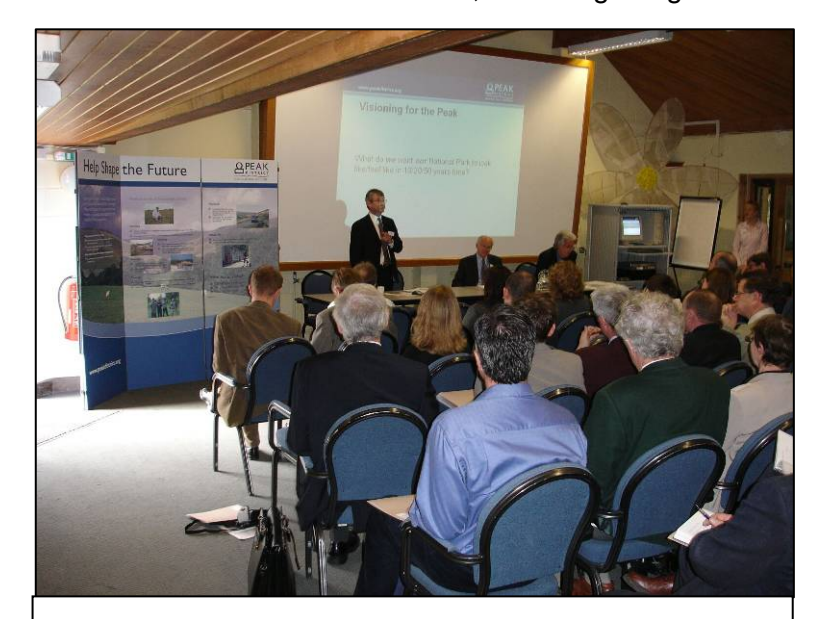
Stakeholder engagement event in May 2005

The league table puts us in 3rd place behind Northumberland and North York Moors, and we are confident that when the next round of surveys takes place on 31st December 2005, we will gain our maximum 21 points through a combination of the Planning Portal, the implementation of a new document management system and the associated Public Access module, and integrating our online payments.