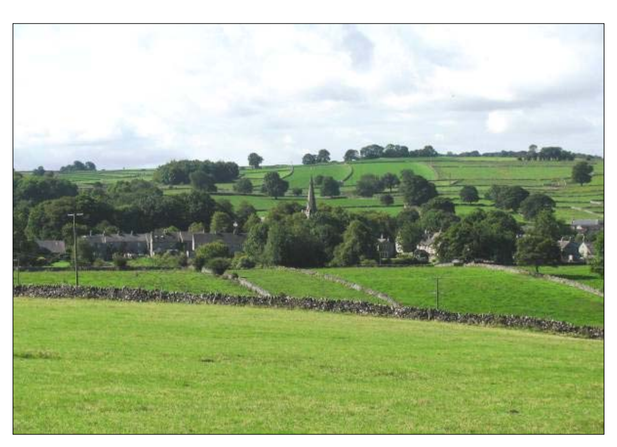
P10.1 Monyash village surrounded by its fossilised medieval field system