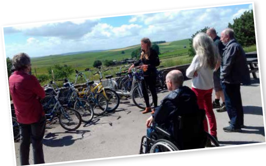
LAF visit to Parsley Hay Visitor Centre

In March, the Forum was updated on the Authority's action plans for the year ahead and received the first Green Lanes Annual Report. LAF members further welcomed the objectives for green lanes as part of the focus to look after these routes as a valued resource. The Forum was also consulted on two traffic regulation orders in 2018 and received updates on the progress of repairs by Derbyshire County Council.