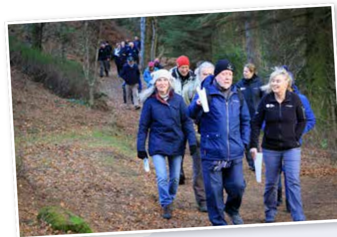
LAF members at the Miles without Stiles launch