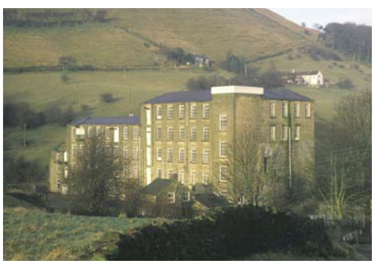
Clough Mills, Little Hayfield

As noted above, the National Park Authority has a key role to play in developing and delivering this Cultural Heritage Strategy, as well as in its monitoring and review. However, the responsibility for successful development and delivery also lies with partners and stakeholders. It is essential therefore that it links with other plans and strategies developed by the Authority as well as those developed by partner and stakeholder groups and