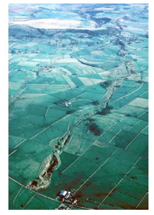
Tideslow Rake, Tideswell

It is the cultural heritage, then – the impact of people and past communities - that generates the local distinctiveness of the Peak District. It provides the sense of place that attracts visitors and residents to the area, attracting inward investment and contributing to the local economy through tourism, leisure, the arts and creative industries and other activities. The attraction lies in the aesthetic