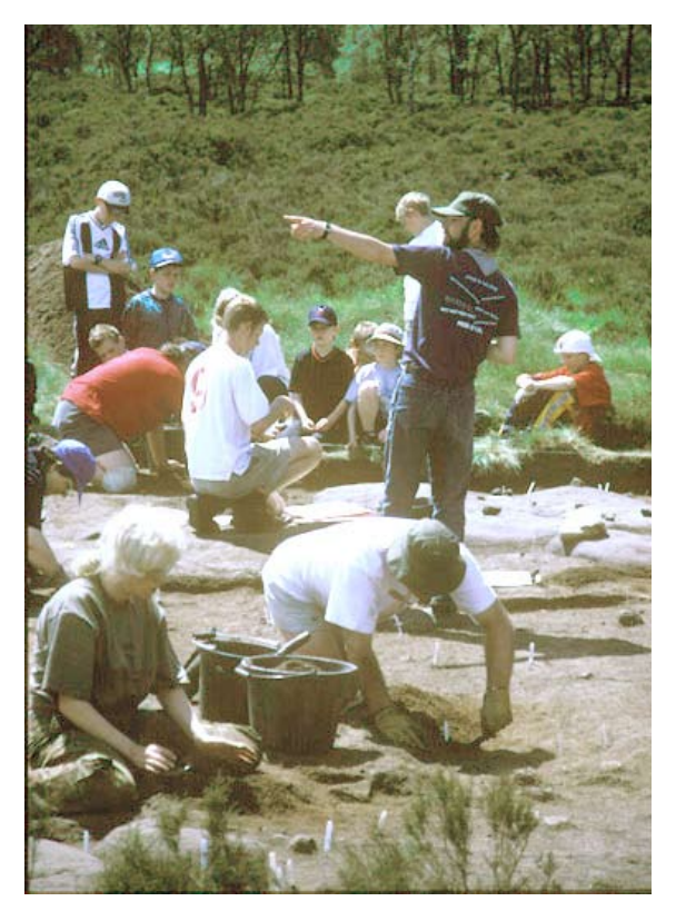
Public archaeology project, Gardom's Edge

Like the Management Plan, the Cultural Heritage Strategy is intended for everyone who has a stake in the National Park. To that end, its development has been informed by consultation with representatives of the multiplicity of individuals and stakeholder groups – communities, businesses, organisations – so that a wide range of views could be taken into account.