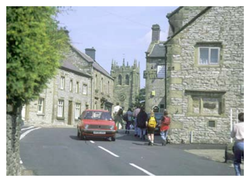
Main Street, Youlgrave village

The historic buildings and structures of the Peak District are a significant feature of the landscape. They range from grand houses and religious buildings through labourers' cottages to field barns and stone crosses. Many factors have shaped the architecture of the Peak, with farming probably the strongest - farmhouses and agricultural buildings are a particularly rich resource. Past industrial activity - lead mining, quarrying and textiles – has left an equally strong legacy. Surviving evidence ranges from mills to workhouses, mine engine houses to weavers' cottages. The development of communications is reflected in guide stoops and bridges, toll houses and railway structures. The Peak District's historic building stock reflects the varying geology and topography, designs and styles, all contributing to the development of a wide range of distinctive local character.