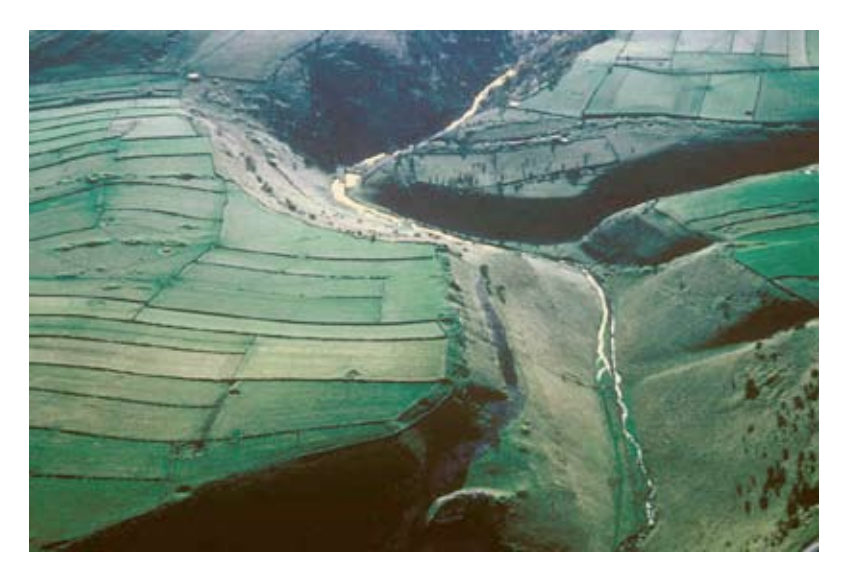
Cressbrook Dale and medieval field system, Wardlow

The creation of the new Team also anticipated the Government's Heritage Protection Reform, which is currently underway. As well as developing a single register of cultural heritage features, the Reform is looking to bring together teams of cultural heritage professionals to streamline outputs and provide single points of focus and better service for customers and stakeholders. This is precisely what the Authority is now well-placed to achieve by encapsulating the management of the cultural heritage within a single Cultural Heritage Team. The success of this arrangement will be, in part, the product of the availability of resources, both physical and financial. Those resources can only be secured by the Authority and its partners and stakeholders working in partnership with one another.