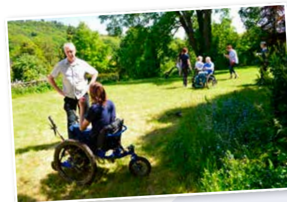
LAF Members and mountain trikes