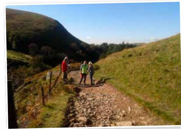
Green Lanes Sub-group visit to Cumberland Lane

At each meeting of the sub-group, LAF members considered access improvements and provided support for the National Park's Access Fund through their advice and guidance and their promotion of it. The first annual report in Autumn 2015 was welcomed and initiatives for the future were considered at the meeting in December.