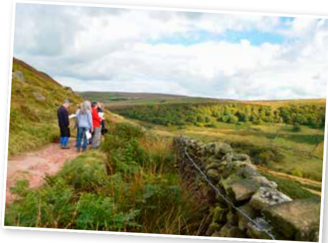
Green Lanes Sub-group visit to Three Shires Head

The LAF received updates from the Access Sub group which met in February, May, July and October to consider the Authority's woodland disposals, dedications, proposals for improving access in the South West Peak and to Yorkshire Water's land, fencing and tracks on moorland and the review of long-term directions on access land.