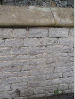
P6.54 Above Left: Drystone wall P6.55 Above Right: Coursed and mortared stone wall