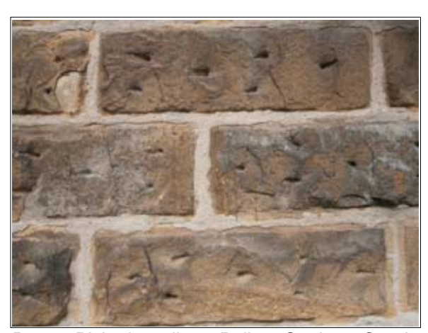
<u>P6.10 Picked tooling, Police Station, Granby</u> <u>Road</u>

6.9 The use of ashlar and other finely dressed stonework for walls was popular for high status buildings during the eighteenth and nineteenth centuries. As this type of stonework