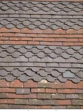
<u>P6.40 Plain red clay tiles, North Church Street</u> <u>P6.41 Plain red and blue clay tiles and blue club</u> clay tile roof covering, Rufford, Buxton Road