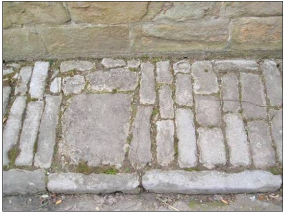
P6.70 Limestone setts and kerbs, Mill Street

<u>P6.69 Above Right, Gritstone blocks, flagstones and kerbs, Castle Street.</u>