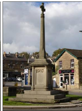
P6.80 Above Left: Water Fountain (Cross's Folly) P6.81 Above Right: War Memorial, Rutland Square

6.51 Most of the historic street furniture in Bakewell appears to have been produced from iron. In particular, the older street name-plates within the town are formed from cast-iron with black lettering on a white background, with some displaying the reverse colour scheme. These features help provide a distinctive character to the Conservation Area.