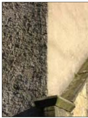
<u>P6.25 Above Left: Remnants of render,</u> <u>Parsonage House</u>

P6.26 Above Right: Building with roughcast to the rear (left) and smooth-faced render to the side (right) gable