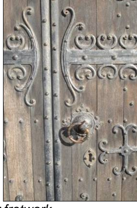
P6.52 Above Left: Timber fretwork P6.53 Above Right: Historic decorative metalwork to the west door, All Saints' Church

6.39 Land in and surrounding Bakewell is enclosed and therefore boundaries contribute significantly to the character of the Conservation Area. A range of boundary types can be found comprising (limestone) drystone walls, mortared walls, hedgerows and metal railings. These not only provide enclosure and variety in both the streetscape and landscape but also reflect the use and status of the land they define as well as providing information on how the area has developed.