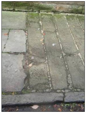
<u>P6.68 Above Left: Gritstone setts and kerbs, King Street.</u>

<u>P6.69 Above Right, Gritstone blocks, flagstones and kerbs, Castle Street.</u>