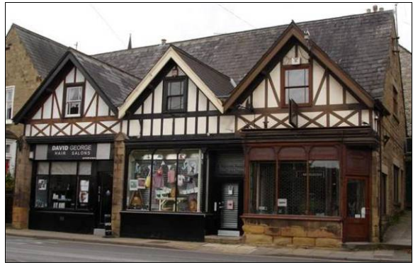
<u>P6.30 Timber-framing to the upper storey of</u> shops, Buxton Road

6.21 The only other known timber-framing in the Conservation Area dates from the late nineteenth and early twentieth centuries. Piedaniels (Bath Street), three shops on the west side of Buxton Road, the end properties to Lumford Cottages (Holme Lane) and houses at the top of Parsonage Croft, all display timber-framing to the upper storeys of front facades. The timber-framing to these buildings is much thinner than earlier timber-framed types. The infill panels also differ in size and shape whilst the bracing appears to be more decorative than structural. This type of timber-framing is not part of the local building tradition.