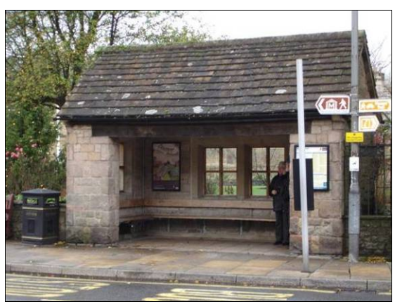
P6.89 Bus Shelter, Rutland Square

6.54 Bus shelters, also part of the street furniture, are principally sited within the town-centre. The majority are constructed from modern designs and materials. However, the bus shelter in Rutland Square is built in a traditional style, from local materials, and integrated within the south boundary wall to Bath Gardens.