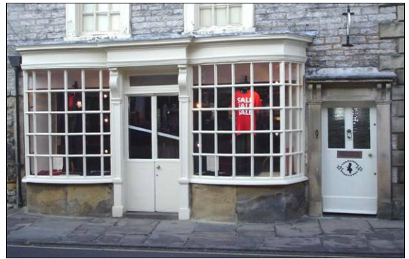
<u>P6.7 Above: Gritstone stall-riser to traditional</u> shop-front

6.8 A variety of tooling finishes can be seen on the faces of Bakewell's sandstone buildings and structures. Common designs include quarter faced punched, sparrow pecked, fluting and broach work. A picked tool finish with a ribbon edging (drafted margins) is a typical nineteenth century tooling detail found in Bakewell. This tooling type was also used on earlier buildings that received new dressings in the nineteenth century.