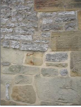
P6.15 Above Left: Limestone and gritstone wall P6.16 Above Right: Wall constructed of gristone and limestone with gritstone quoins

6.12 Another limestone type which has been used for building structures in Bakewell is Tufa. This porous soft limestone is formed from the precipitation of mineralised water springs, from calcareous rocks. Tufa is much later in date than the other stone types in the area, formed approximately 10,000 years ago and growth continues in the present. This pumice-like stone was sourced locally from Alport and Matlock Bath and was particularly popular in the nineteenth century, for constructing grottoes and Some of the gardens within the rockeries. Conservation Area contain Tufa, for example Bath Gardens and Milford House. decorative arches within the sensory garden, part of Riverside Garden, at the rear of Bridge House are also constructed from this stone.