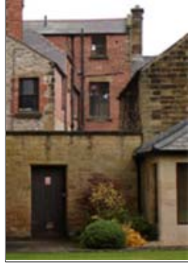
<u>P6.19 Above Left: Hand-made bricks, Granby</u> Mews

<u>P6.20 Above Right: Brick rear elevation, Town</u> <u>Hall</u>