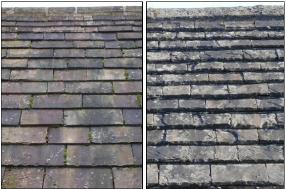
<u>P6.37 Above Left: Yorkshire stone slate</u> P6.38 Above Right: Derbyshire stone slate

6.29 Natural blue slate is the predominant roof covering in the Conservation Area with Welsh slate being the most common. These vary in colour from blue-grey to purple. Blue slate started to appear in Bakewell in the nineteenth century when the transportation of materials became easier. Other types of blue slate can also be found on roofs in Bakewell. For example, Burlington slate covers the roof of the Catholic Church of the English Martyrs, Buxton Road (Malcolm Sellors pers.com.). Quarried in the Lake District, Burlington slate is typically blue-grey and laid in diminishing courses, Westmorland slate also from the Lake District is found on roofs in the Conservation Area. This slate type has a distinctive green colour and can be seen on the roof of Newholme Baslow Road (Malcolm Hospital, pers.com.).