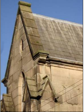
P6.5 Above Left: Gritstone quoins and limestone walling

P6.6 Above Right: Various gritstone details