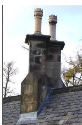
P6.11 Above Left: Ashlar P6.12 Above Right: Gritstone ashlar chimneystacks