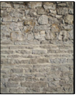
P6.13 Above Left: Limestone wall constructed on bed rock, South Church Street P6.14 Above Right: Limestone Wall, coursed to the lower part and random rubble to the upper

6.11 The walls of older vernacular buildings in the Conservation Area were generally built from random rubble limestone. This stone type was also used for less prominent elevations to later buildings and many of the boundary walls