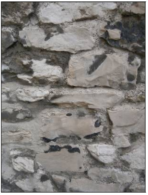
P6.18 Detail from Chert Wall, Brookside

including Holme Bank, The Undercliff and Endcliff (Bowering & Flindall, 1998). As chert is hard to work its use is restricted to walling construction. It was sometimes incorporated in boundary walls in the town, as can be seen in the southern boundary wall along Brookside. Chert was also used in the walls to Rock House, Buxton Road and Holme Hall. Both these properties are in close proximity to former Chert quarries.