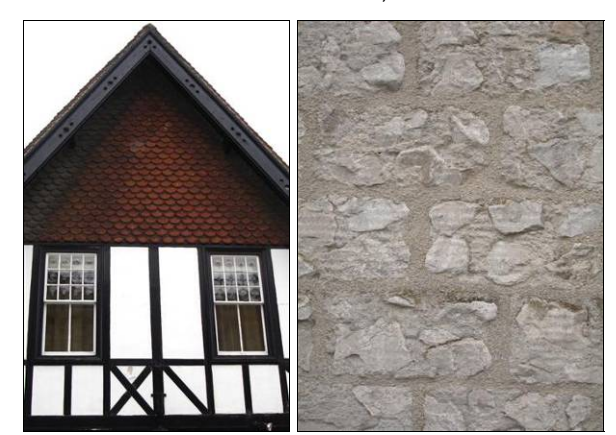
P6.33 Above Left: Red clay tile hanging, Piedaniels, Bath Street P6.34 Above Right: Davie Block