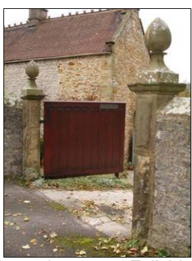
P6.56 Above Left: Gate-piers to Fellside, Stanedge Road

P6.57 Above Right: Gate-piers to Butts House