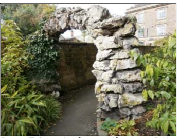
<u>P6.17 Tufa arch, Sensory Gardens, Bridge</u> <u>Street</u>

6.12 Another limestone type which has been used for building structures in Bakewell is Tufa. This porous soft limestone is formed from the precipitation of mineralised water springs, from calcareous rocks. Tufa is much later in date than the other stone types in the area, formed approximately 10,000 years ago and growth continues in the present. This pumice-like stone was sourced locally from Alport and Matlock Bath and was particularly popular in the nineteenth century, for constructing grottoes and Some of the gardens within the rockeries. Conservation Area contain Tufa, for example Bath Gardens and Milford House. decorative arches within the sensory garden, part of Riverside Garden, at the rear of Bridge House are also constructed from this stone.