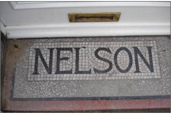
P6.79 Tessellated threshold to shop entrance, Buxton Road

P6.78 Above Right: Allsop & Son, Bakewell, grid cover