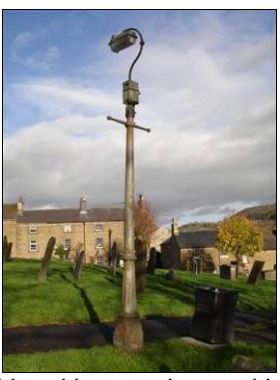
P6.90 Above Left: Traditional lamp column with directional sign P6.91 Above Right: Traditional street-light, All Saints' church-yard