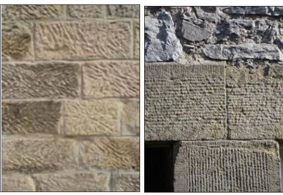
P6.8 Above Left: Quarter faced punched tooling P6.9 Above Right: Door Surrounds with narrow fluting and drafted margins

6.8 A variety of tooling finishes can be seen on the faces of Bakewell's sandstone buildings and structures. Common designs include quarter faced punched, sparrow pecked, fluting and broach work. A picked tool finish with a ribbon edging (drafted margins) is a typical nineteenth century tooling detail found in Bakewell. This tooling type was also used on earlier buildings that received new dressings in the nineteenth century.