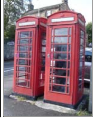
<u>P6.83 Above Left: Traditional red letter-box</u> <u>P6.84 Above Right: K6 telephone boxes, Buxton</u> <u>Road</u>

6.53 A variety of bollards help articulate space in the town, ranging from traditional metal municipal designs to simple timber bollards, gritstone pillars, metal and concrete posts. The gritstone pillars in particular contribute to the distinctive appearance of the settlement, harmonising with the surrounding buildings and walls.