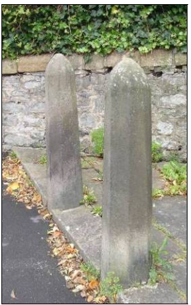
<u>P6.85 Above Left: Gritstone bollards, King</u> Street.

<u>P6.86 Above Right, Gritstone bollards, All</u> Saints' Church.