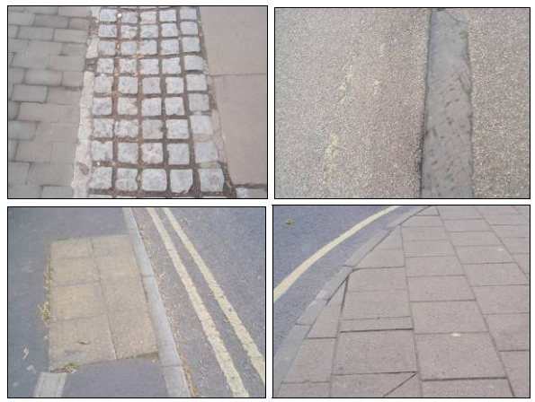
<u>P6.73 Above Left: Gritstone flags and setts and limestone setts</u>

6.48 A range of modern pavement treatments, mainly comprising bound aggregate surface dressing, concrete flags, setts and kerbs, are primarily found in the town-centre. In addition, red and buff blister modules provide tactile paving at road crossings, usually contrasting in colour with the surrounding footway treatment.