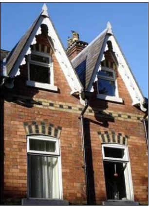
P6.21 Above Left: Blue engineering brick chimneys visible from Portland Square P6.22 Above Right: Polychrome brickwork, Highfield House, Yeld Road