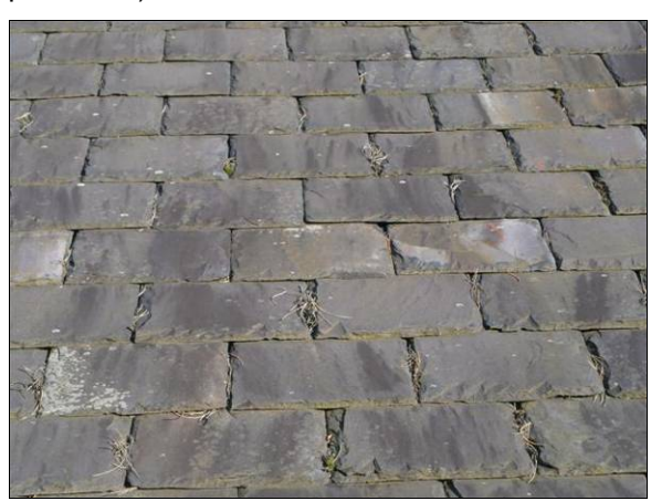
P6.39 Blue slate roof covering

6.29 Natural blue slate is the predominant roof covering in the Conservation Area with Welsh slate being the most common. These vary in colour from blue-grey to purple. Blue slate started to appear in Bakewell in the nineteenth century when the transportation of materials became easier. Other types of blue slate can also be found on roofs in Bakewell. For example, Burlington slate covers the roof of the Catholic Church of the English Martyrs, Buxton Road (Malcolm Sellors pers.com.). Quarried in the Lake District, Burlington slate is typically blue-grey and laid in diminishing courses, Westmorland slate also from the Lake District is found on roofs in the Conservation Area. This slate type has a distinctive green colour and can be seen on the roof of Newholme Baslow Road (Malcolm Hospital, pers.com.).