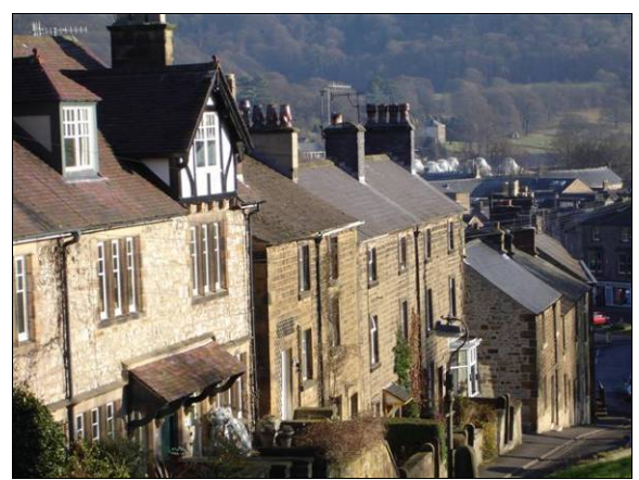
<u>P6.35 View over rooftops, from All Saints'</u> <u>churchyard</u>

6.25 Buildings in the Conservation Area are laid out at different levels therefore roofs make an important contribution to the character of the Conservation Area, particularly when viewed from higher parts of the settlement or its setting.