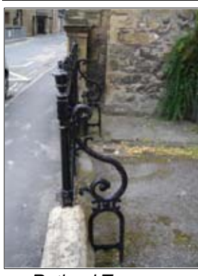
P6.59 Above Left: Railings, Rutland Terrace P6.60 Above Right: Railings, Royal Bank of Scotland, Rutland Square P6.61 Below Left: Railings, Bath House P6.62 Below Right: Boot scrape combined with Stay-back to railings, Bath Street

6.43 Painted metal gates and timber gates form part of the boundary treatment to many properties in the Conservation Area. These vary in design from ornate metal gates, five bar gates to simple picket timber gates.