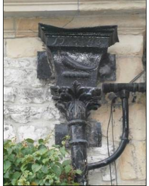
P6.42 & P6.43 Above: Examples of lead hopperheads and downpipes

6.33 In the eighteenth and nineteenth centuries cast-iron rainwater gutters, with half-round or ogee profiles, or secret gutters behind parapets became commonplace. These often discharged into cast iron hopper heads and plain circular section down-pipes. In Bakewell, there are also examples of gutters incorporated within elaborate stone cornices, for example buildings lining the southern side of King Street.