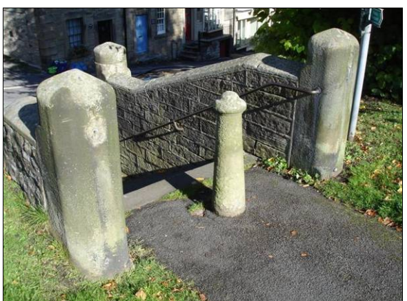
P6.58 Gritstone gate-piers and bollard, All Saints' Church

P6.57 Above Right: Gate-piers to Butts House