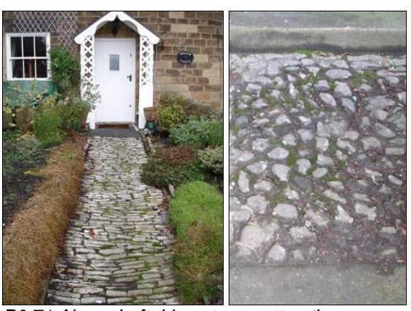
P6.71 Above Left: Limestone sett pathway P6.72 Above Right: Pitchings, Lyndon Villa