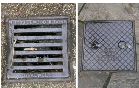
P6.77 Above Left: Littlewood & Son, Bakewell, grid cover.

6.49 Drain and inspection-covers are incorporated within many of the carriageways and footways throughout the town. Some of these are historic and produced locally, for instance, 'Allsop & Son Contractors Bakewell' and 'Littlewood & Son Bakewell' are cast into grid covers within the settlement, see P6.77 and P6.78. Another feature that provides interest to the footways in the town-centre is the traditional floor treatment to shop entrances, see P6.79.