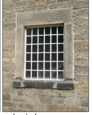
P6.46 Top Left: Timber sash window P6.47 Top Right: Stained glass, Nat West Bank P6.48 Middle Left: Leaded Lights, Bath House P6.49 Middle Right: Leaded lights with timber frames, Minden Cottage, Church Lane P6.50 Below Left: Timber multi-paned casement window, Arkwright Square P6.51 Below Right: Cast iron multi-paned

<u>P6.51 Below Right: Cast iron multi-paned</u> windows, Victoria Mill