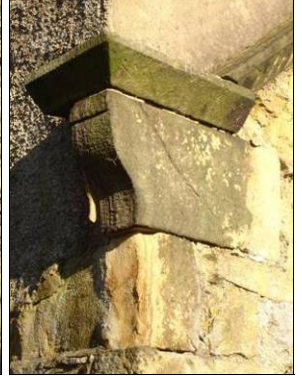
P6.3 Above Left: Gritstone window surround P6.4 Above Right: Gritstone kneeler