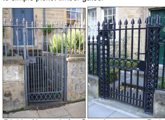
P6.63 Above Left: Cast iron gate, Rutland Terrace

6.43 Painted metal gates and timber gates form part of the boundary treatment to many properties in the Conservation Area. These vary in design from ornate metal gates, five bar gates to simple picket timber gates.