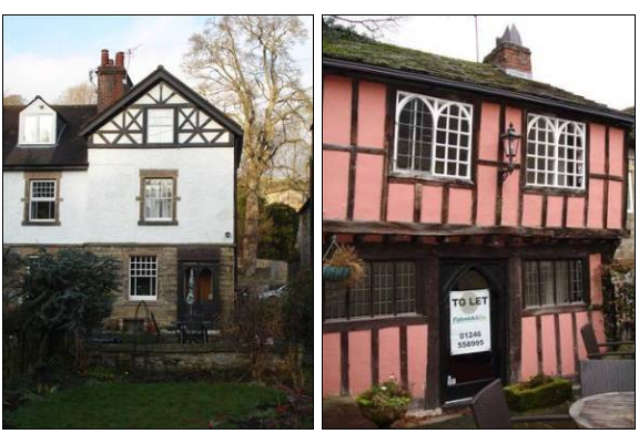
<u>P6.31 Timber-framing, Lumford Cottages</u> <u>P6.32 Timber-framing, Avenel Court</u>

6.22 A jettied close-studded timber-framed building, with pink coloured infill panels, is located within the courtyard at the rear of Avenel Court, off King Street. This structure was built in the 1950s using reclaimed timbers from the Moon Inn, Stoney Middleton (Brighton & Strange, 2005).