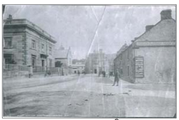
P6.67 Rutland Square in the 19<sup>th</sup> century

6.47 Both gritstone and limestone setts and kerbs were historically used for footways in Bakewell. Traditional gritstone kerbs provide the edging to pavements in many parts of the Conservation Area whilst only a few limestone kerbs survive. These can be found at the bottom of Stanedge Road and parts of Mill Street. Gritstone flags and blocks are another traditional