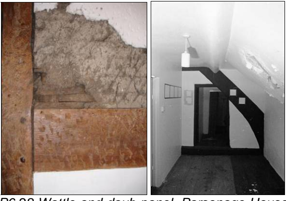
<u>P6.28 Wattle and daub panel, Parsonage House</u> <u>P6.29 Cruck frame concealed within Bagshaw</u> Hall

6.21 The only other known timber-framing in the Conservation Area dates from the late nineteenth and early twentieth centuries. Piedaniels (Bath Street), three shops on the west side of Buxton Road, the end properties to Lumford Cottages (Holme Lane) and houses at the top of Parsonage Croft, all display timber-framing to the upper storeys of front facades. The timber-framing to these buildings is much thinner than earlier timber-framed types. The infill panels also differ in size and shape whilst the bracing appears to be more decorative than structural. This type of timber-framing is not part of the local building tradition.