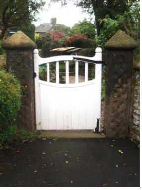
<u>P6.65 Above Left: Metal gate, South Church</u> Street

P6.66 Above Right: Timber gate, Brookside