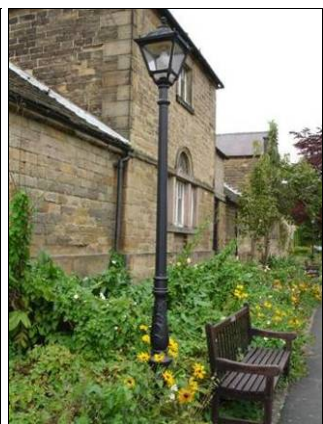
P6.92 Above Left: Police Lantern, Granby Road P6.93 Above Right: Modern Victoriana lamp column, Bath Gardens