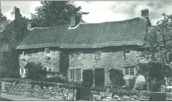
P6.36 Thatched properties, South Church Street

6.26 Thatch was historically used as a roof covering to properties in Bakewell but none survives. Photographs from the late nineteenth and early twentieth centuries show Dial Cottage and 3 South Church Street with thatched roofs. Other properties in the Conservation Area that were once thatched include Braeside and Minden Cottages on Church Lane and The Cottage, Butts Road.