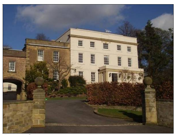
P6.27 Castle Hill House

6.18 Stucco, another type of render, has been used to the external walls of Castle Hill House. This plaster finish is incised to deliberately simulate ashlar, a more costly walling material.