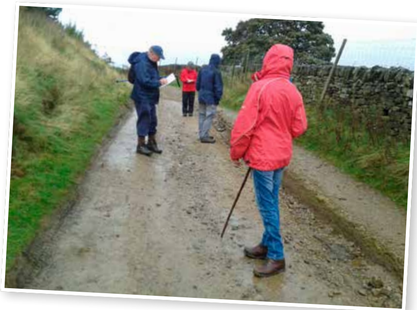
LAF Green Lanes Sub-group visit to Kiln Bent Lane, Holme Valley

The Forum was consulted on three possible traffic regulation orders and repairs on two routes during 2016. The LAF also carried out site inspections on priority routes in the Kirklees and Sheffield parts of the National Park. Legal status updates were provided by DCC and the PDNPA reported on the first meeting of the nationwide Motor Vehicle Stakeholders Working Group. The Green Lanes sub-group met in April and October