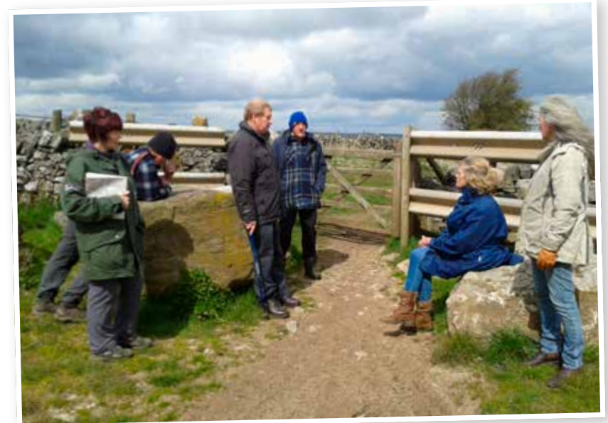
LAF Green Lanes Sub-group visit to Derby Lane, Monyash