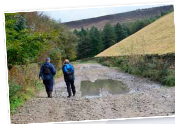
LAF Green Lanes Sub-group visit to Kiln Bent Lane, Holme Valley