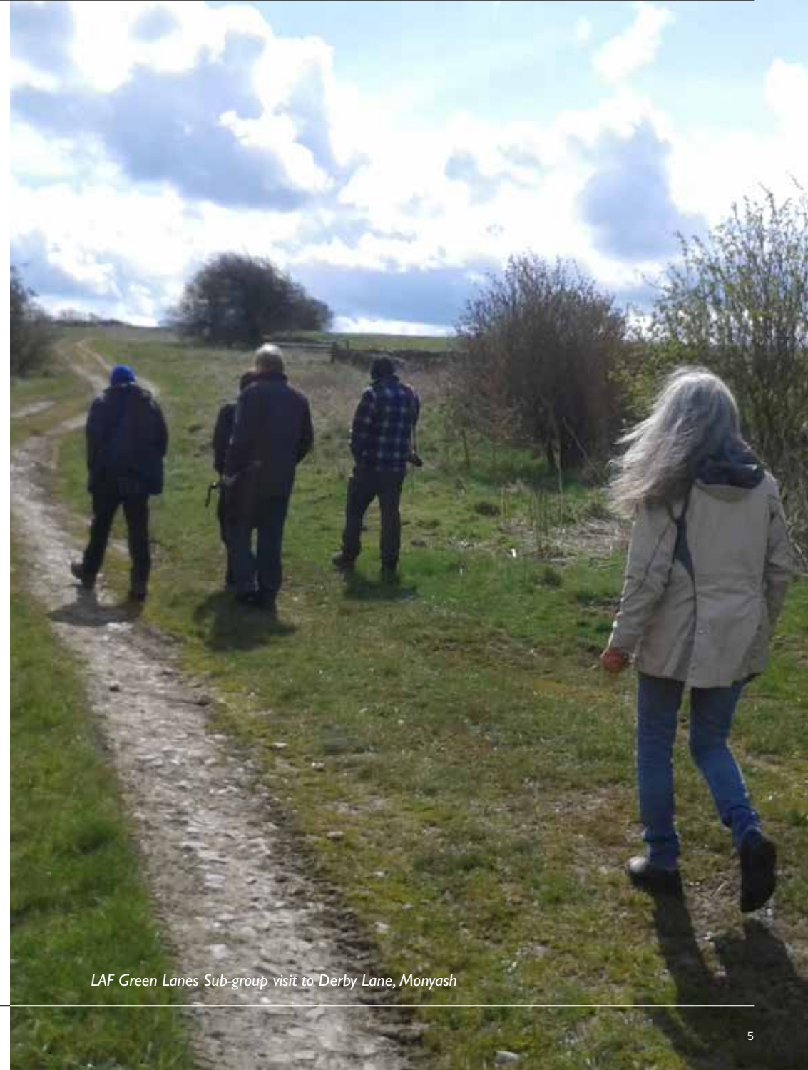
LAF Green Lanes Sub-group visit to Derby Lane, Monyash

In 2016, the Local Access Forum introduced audio webcasting for its meetings so that people could listen in live and following the meeting.