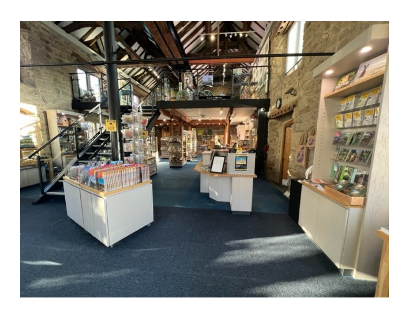
Inside centre. Flat, carpeted area to main counter and main stairs to Mezzanine floor.