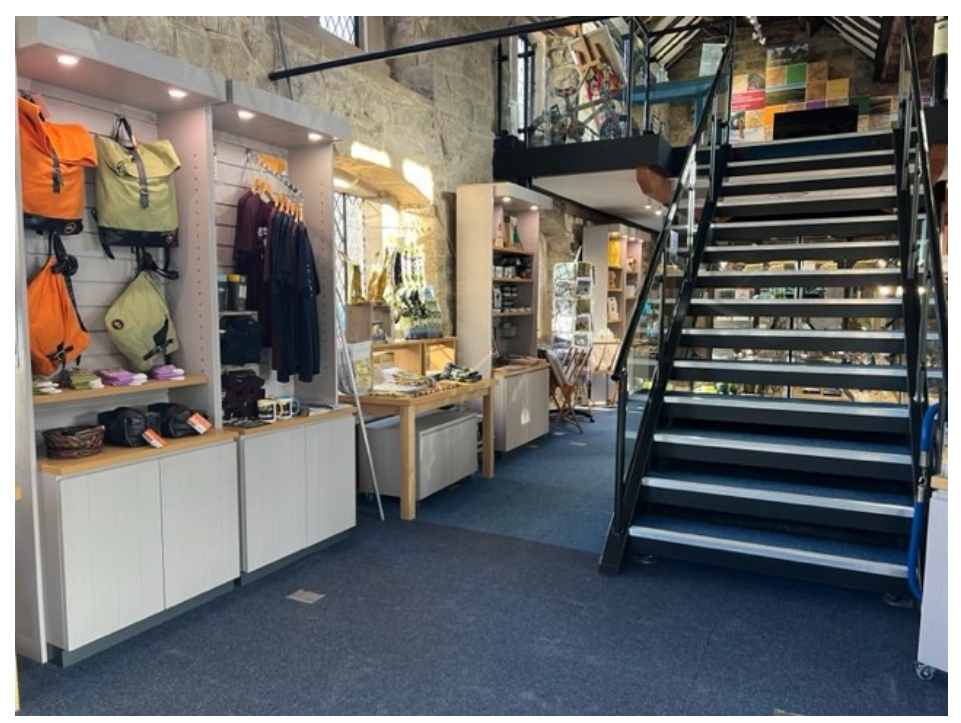
Stairs to Mezzanine floor