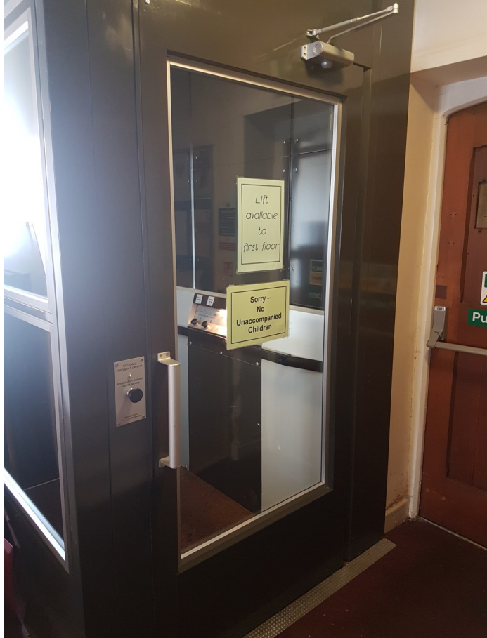
Rear of centre. Lift on lower floor to Mezzanine floor. Also fire exit.