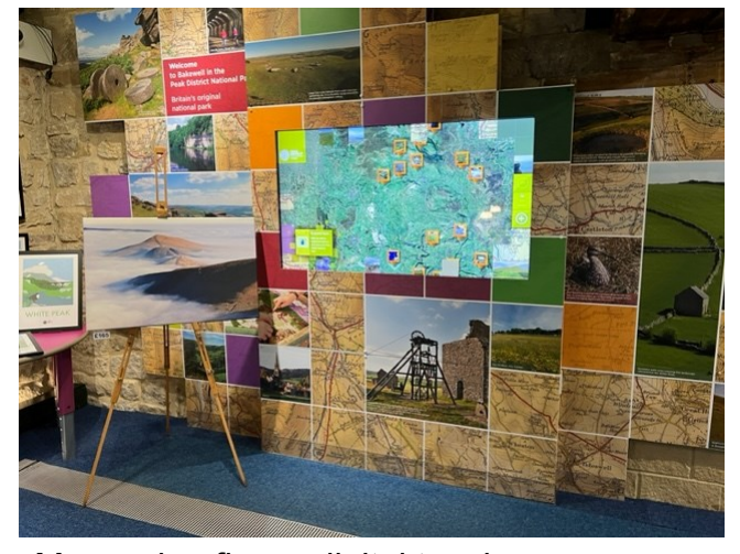
Mezzanine floor - digital touchscreen