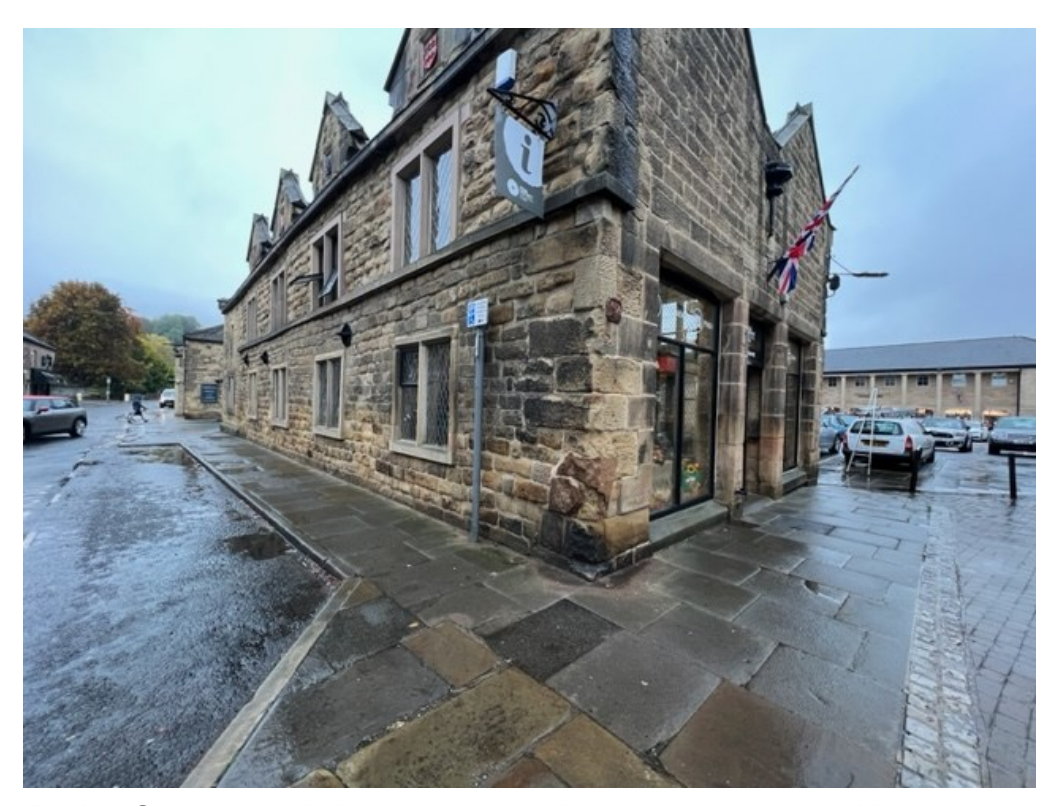
Bridge Street disabled parking bay adjacent to centre and Market Place car park.

Arrival Path to the main entrance: There is level access from the street to the main entrance.