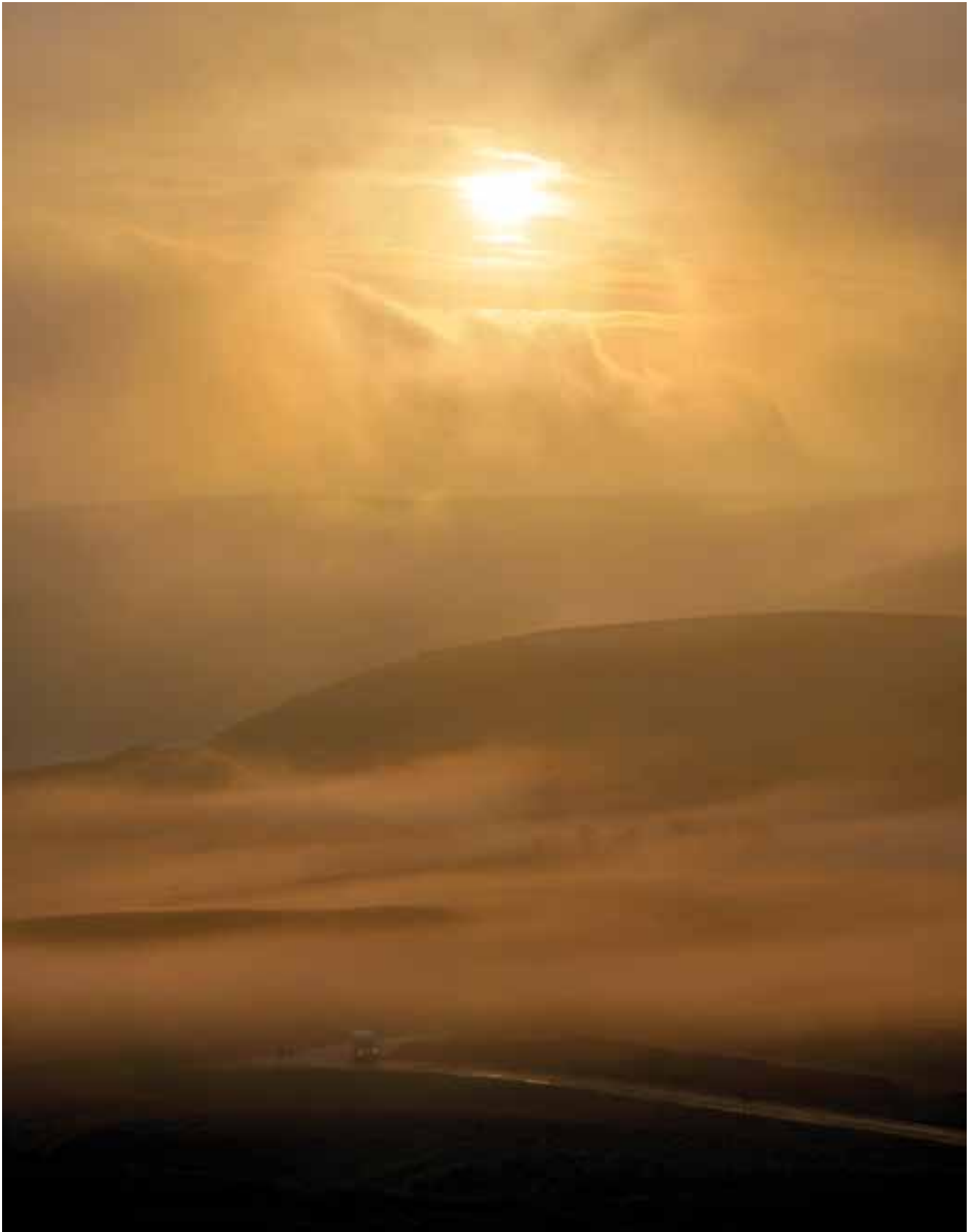
Mam Tor in early morning mist