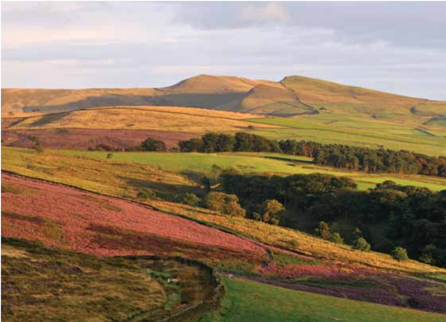
Heather and hill near Glossop

This Action Plan sets out how the Landscape Strategy and Guidelines will be delivered across the National Park as a whole. It is important that the appropriate sections of the Landscape Strategy are read to provide background information and to inform the Action Plan. The Action Plan has been produced by the Peak District National Park Authority, with input from many stakeholders, including community groups and individuals. The Action Plan is for the whole National Park, and the delivery of these actions will often require a partnership approach. Appropriate lead partners have therefore been identified for each action. Implementation of these actions will be by various means; some will be part of day-to-day work, others will be specific projects and some will be resource-reliant, both in terms of funding and staffing.