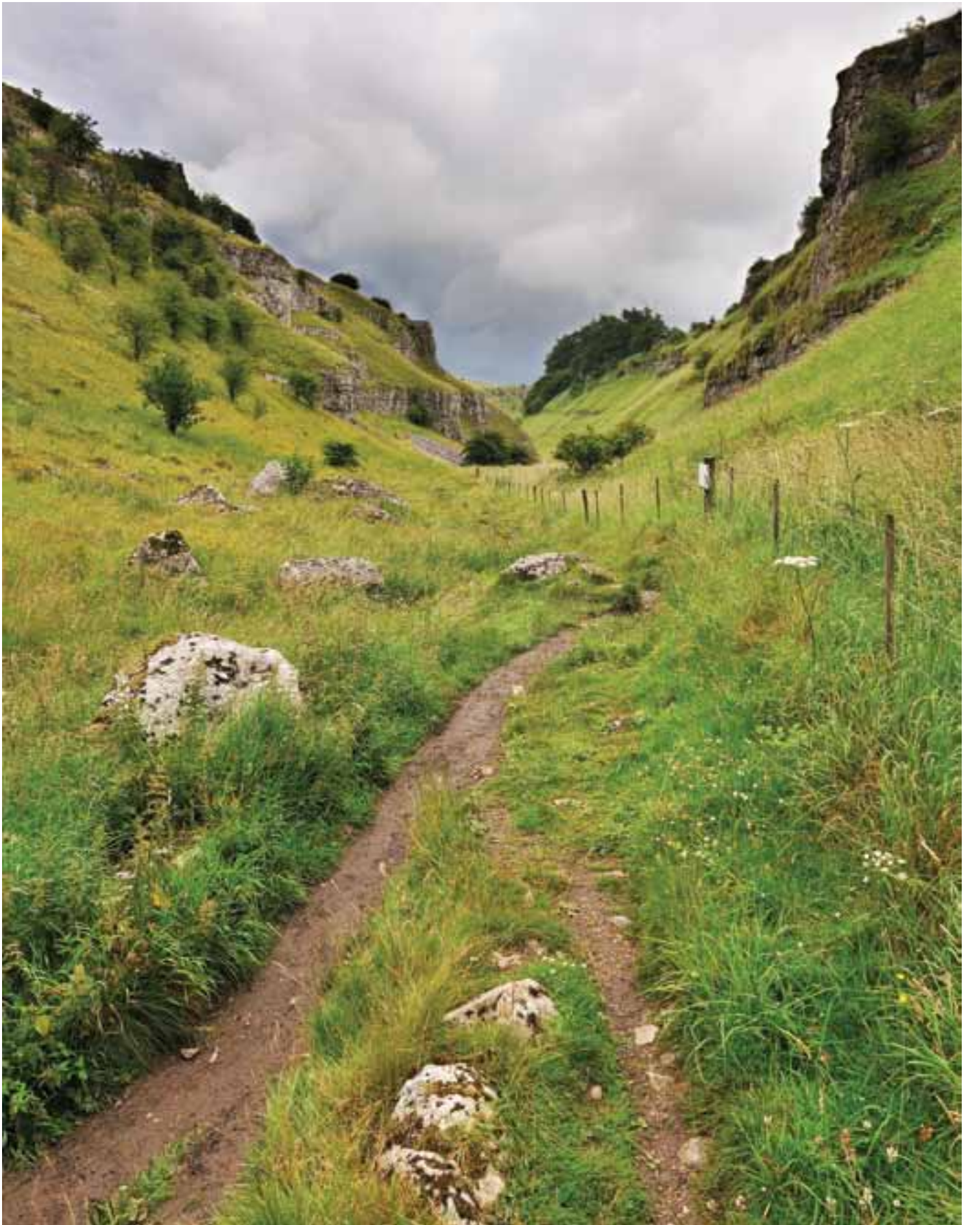
Lathkill Dale